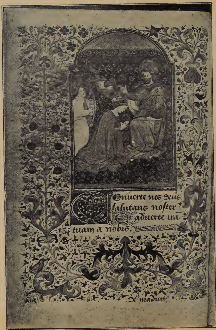
Horæ B. V. Mariæ—15th Century, 163 pages (Codex Msc. 291). Photo-reproduction of Page 75 from the original in the Abbey of Maria Einsiedeln, "Initium Completorii" with Miniature "The Crowning of Our Blessed Lady" exquisitely executed in richly harmonizing colors set in a highly decorative floral border. This elaborate Hour Book also contains eleven full-page pictures masterfully illuminated with the utmost care to detail, and every folio is notable for its varying and highly ornate design.